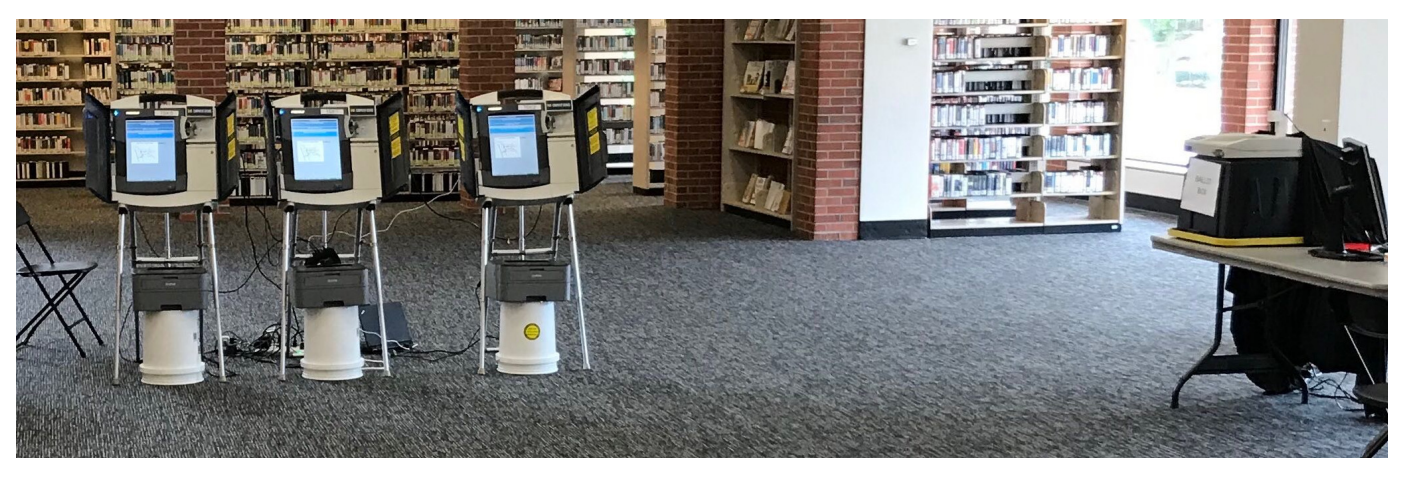
Fig. 1: Polling Place Setup . We established mock polling places at two public libraries in Ann Arbor, Michigan, with three BMDs ( left ) and an optical scanner and ballot box ( right ). Library visitors were invited to participate in a study about a new kind of election technology. The BMDs were DRE voting machines that we modified to function as malicious ballot marking devices.

on how to use the equipment, but they were not alerted that the study concerned security or that the BMDs might malfunction.