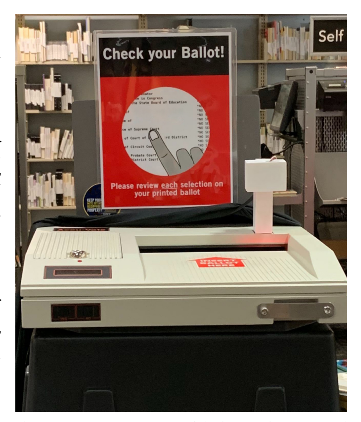
Fig. 3: Warning Signage . One of the interventions we tested was placing a sign above the scanner that instructed voters to verify their ballots. Signage was not an effective intervention.

<sup>1</sup>Mighty Trisha unexpectedly beat Creepy Bob, leading some Bob supporters to complain that the results were fishy [4].