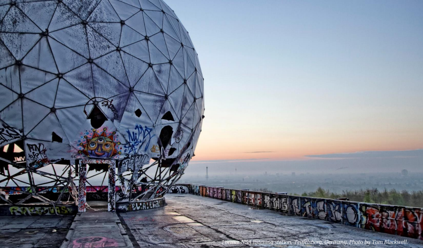
Former NSA listening station, Teufelsberg, Germany.